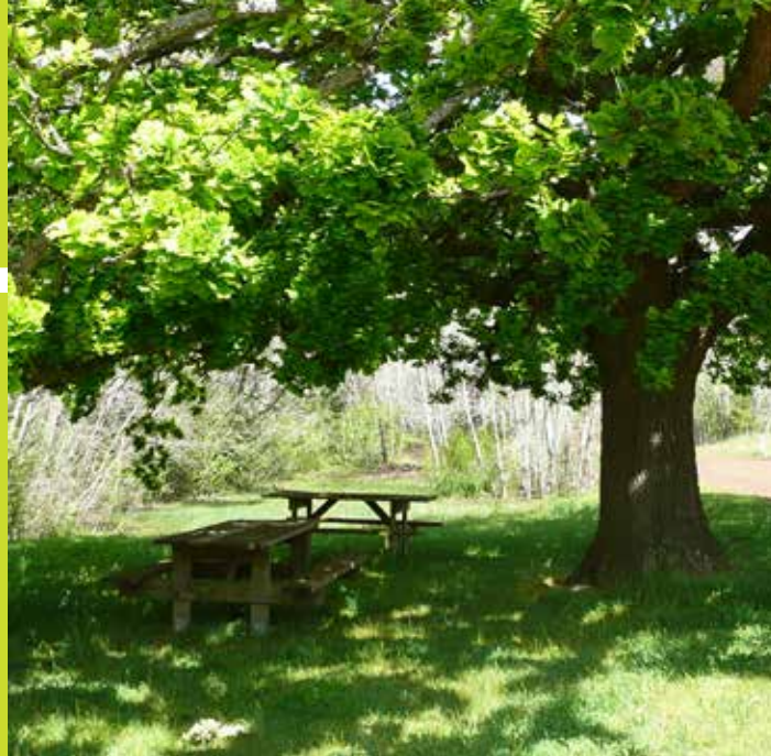
MOYNE REGION.

Philanthropy means “love of humanity” and there are many ways to be a philanthropist – by volunteering, establishing memorials, making bequests, becoming benefactors, sponsors, contributing regularly through workplace giving or making one off donations.