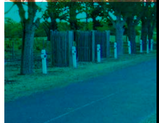
EURACK AVENUE OF HONOUR.