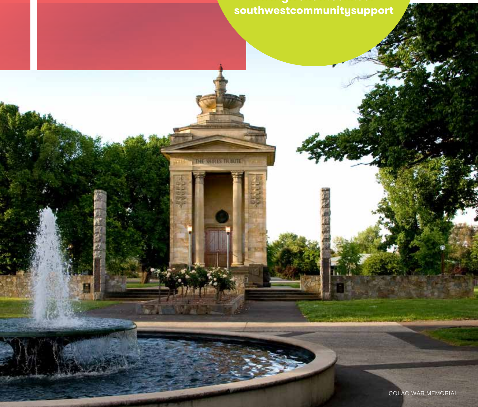
COLAC WAR MEMORIAL

Make a donation at www.givenow.com.au/ southwestcommunitysupport