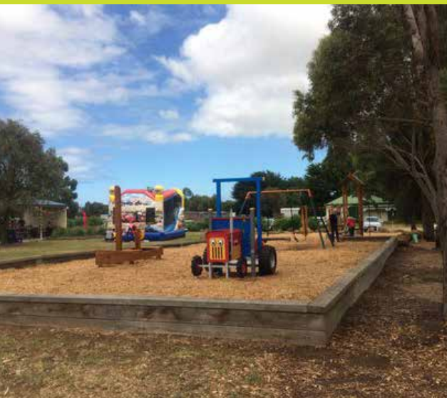
KOROIT PLAYGROUND.