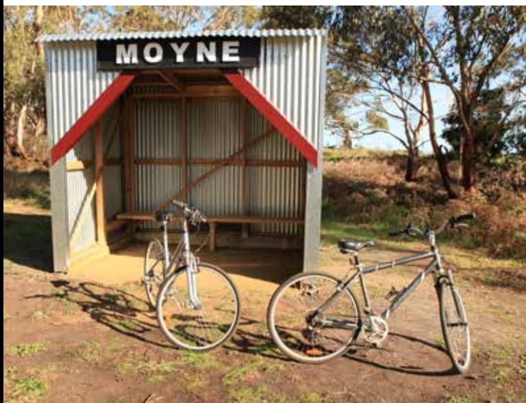
PORT FAIRY TO WARRNAMBOOL RAIL TRAIL COMMITTEE SHELTER PROJECT 2016.

The Foundation is structured as a public not-for-profit company limited by guarantee.