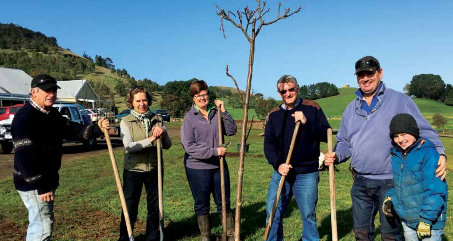
Launch of the 'Little Miss Sunshine' project 2016 at Camperdown Pastoral & Agricultural Society & Showground

The following tables show the breakdown of where the funds were distributed in the region and in what focus areas the projects were based on as well. Having this information assists the Foundation in looking at focusing more support in certain areas and regions into the future.