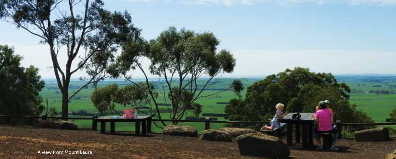
A view from Mount Leura