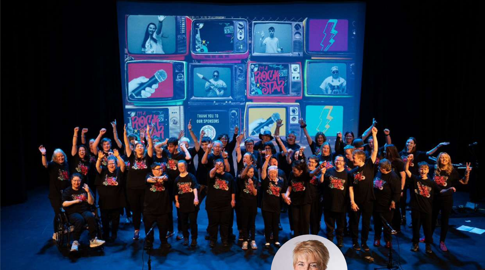
Colac Maker's Space